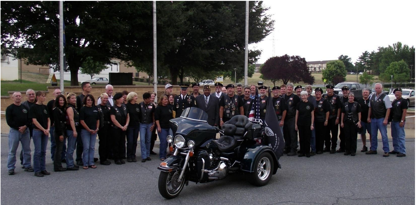
Francis Scott Key American Legion Post 11, Frederick, Maryland